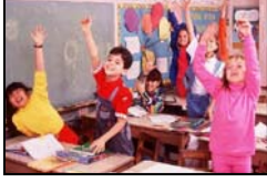
Back To School